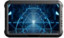
Compatible with Optional External Touch Screen